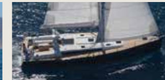
Beneteau Oceanis 48