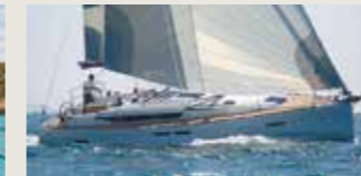
Jeanneau Sun Odyssey 449