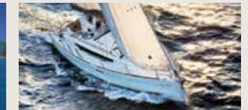
Sun Odyssey 389