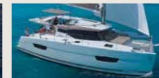
Fountaine Pajot Lucia 40