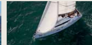
Jeanneau Sun Odyssey 349