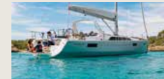
Beneteau Oceanis 41.1