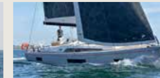
Beneteau Oceanis 46.1