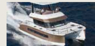
Fountaine Pajot MY37