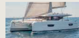
Fountaine Pajot Astrea 42