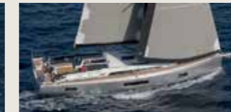
Beneteau Oceanis 51.1