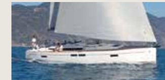
Jeanneau Sun Odyssey 479