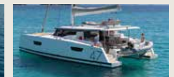
Fountaine Pajot Saona 47